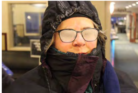
With apologies to our blog followers!